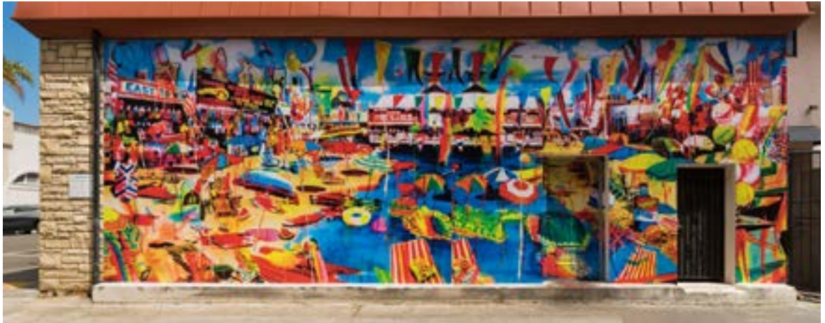
Rosson Crow, Ocean Front Property in Arizona (2022)